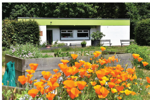
The Bike Garden.